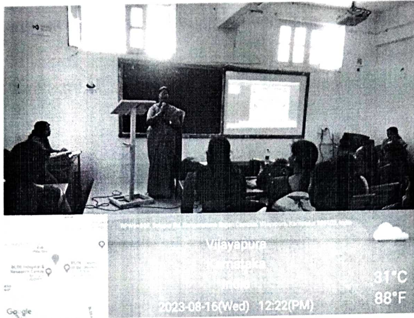
Resource Person addressing the gathering