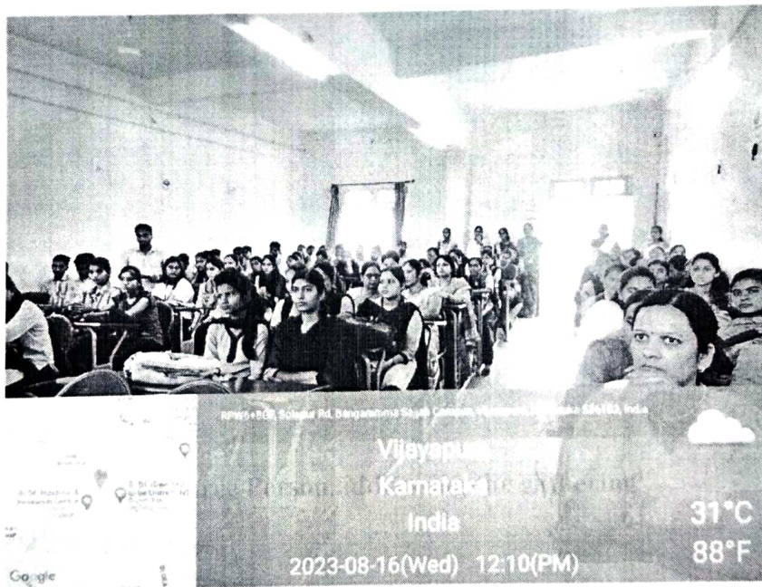
Active Participation of students